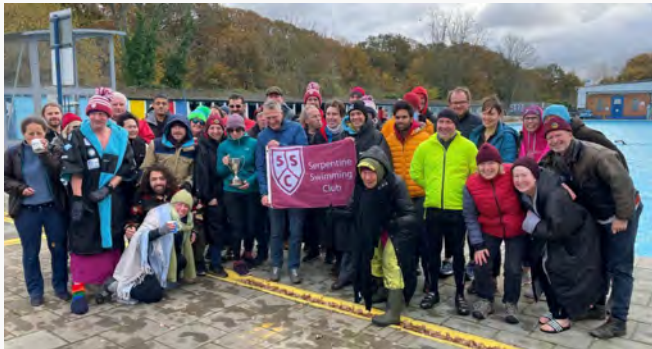
Team Serpentine, 2021