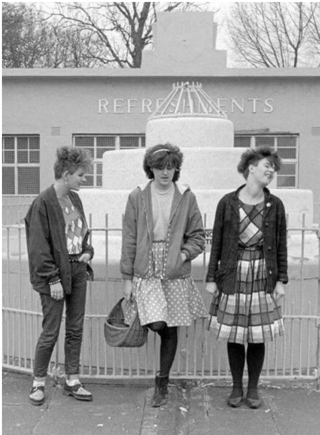
Marine Girls wait in vain for the Café to open

The picture is of the Marine Girls, who had a brief but influential pop career back in the day. The eagle eyed amongst you will recognise Tracey Thorn who, of course, went on to great things with Everything But The Girl.