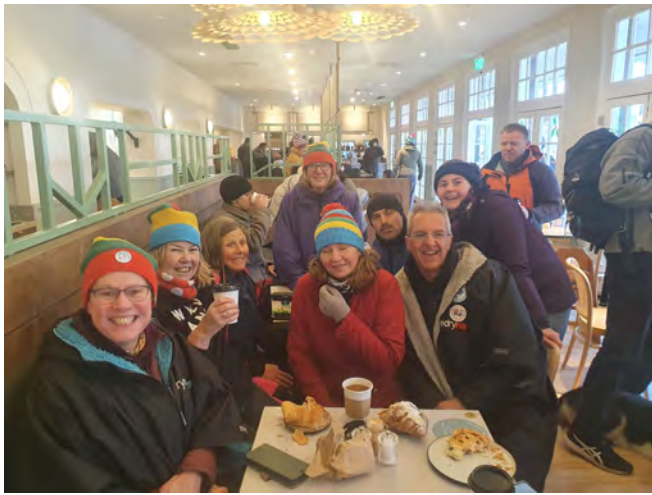
Third Leg – Parliament Hill Lido